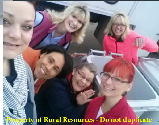
Property of Rural Resources - Do not duplicate

Shredding documents that have personally identifying information on them is one big step toward preventing identity theft! So, until next year, keep on shredding at home or securely save your documents for the next event.